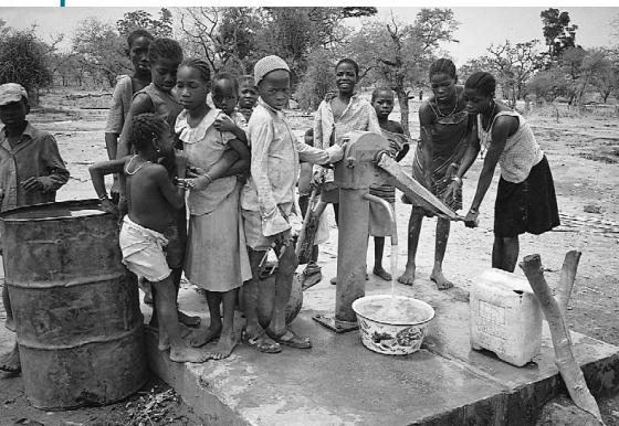
Careful management of water resources is essential if these children's children are also to enjoy a plentiful supply of water.

Environmental isotopes are the only means of identifying paleowater. This can be done by measuring the radioactive isotope carbon-14. Measuring the level of deuterium, tritium and oxygen-18 also provides dating evidence because, as the world's climate has