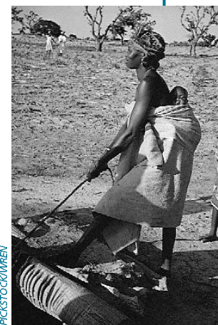
Water - a scarce and precious resource upon which humanity depends for its existence.

The Africa Regional Groundwater Model Project expands and enhances the use of isotopic techniques and puts strong emphasis on the involvement of the end user. A further objective of the Model Project is to strengthen regional capabilities and regional co-operation.