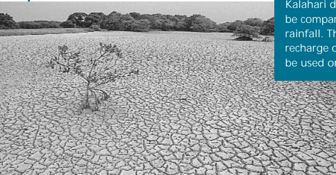
A LEGUMINISTAL PICTURES